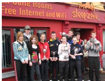
Celebrating the weekends success with their trophies