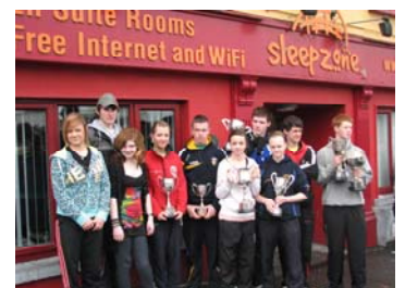
Bhí deireadh seachtaine ar dóigh acu