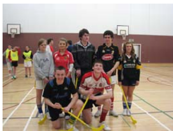
Prepared for the uni-hoc!