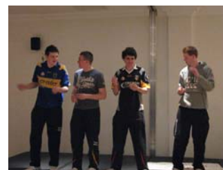
The boys - taking part in the singing competition - they won!